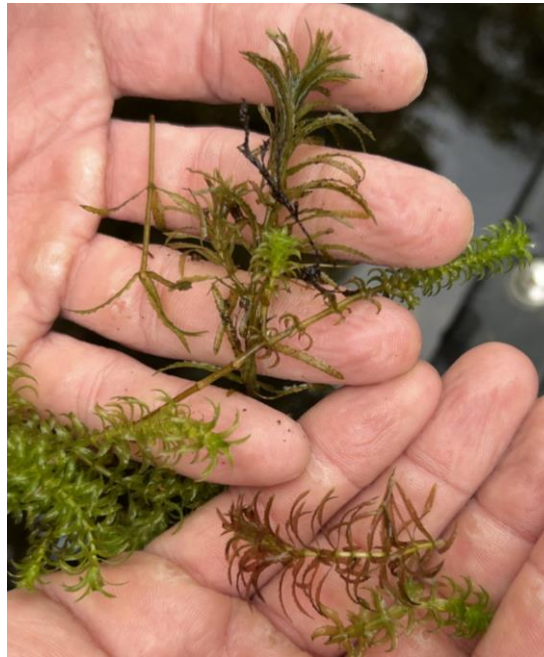
Top: Lake Sebago Hydrilla fragments showing plant variation. Bottom: Underground tubers (left) and above ground turions (right).