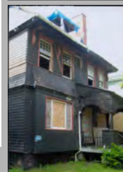
A fire-damaged, one-family house was rehabilitated for two rental units. As an income-producing property, it qualified for the commercial tax credit program.