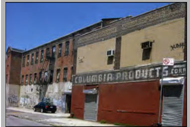
Rehabilitation of 221 McKibben Street in Brooklyn created affordable industrial spaces for small firms and preserved both the physical industrial heritage of the community and local opportunities for industrial jobs.