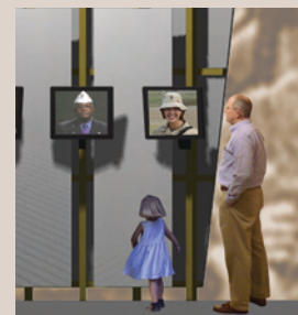
Exhibition Design by Ciulla Design

It is very powerful to listen to the stories of veterans and their families, and to learn from them. Visitors to these intimate, interactive video spaces will be able to choose questions and hear answers that give them a deeper appreciation of the Purple Heart and its meaning.