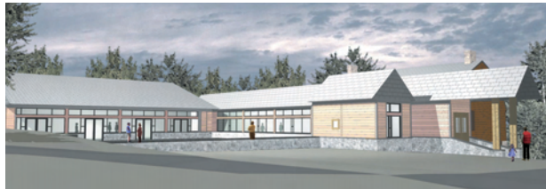
Architecture by EYP Architects, Albany, NY

New Windsor Cantonment State Historic Site is the location of the final encampment of George Washington's Army at the close of America's War of Independence, and plays a central role in the history of the Purple Heart.