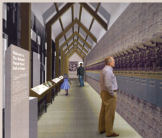
Exhibition Design by Ciulla Design

As visitors walk the corridor from the entry to the main exhibition, they will journey through a detailed timeline that describes the history of the Purple Heart, our country's various military campaigns, and the number of Purple Heart recipients associated with each of them.